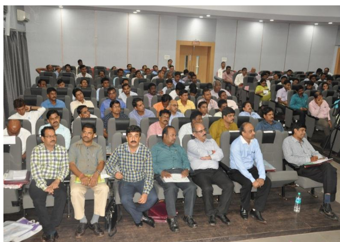
Participants in the Workshop