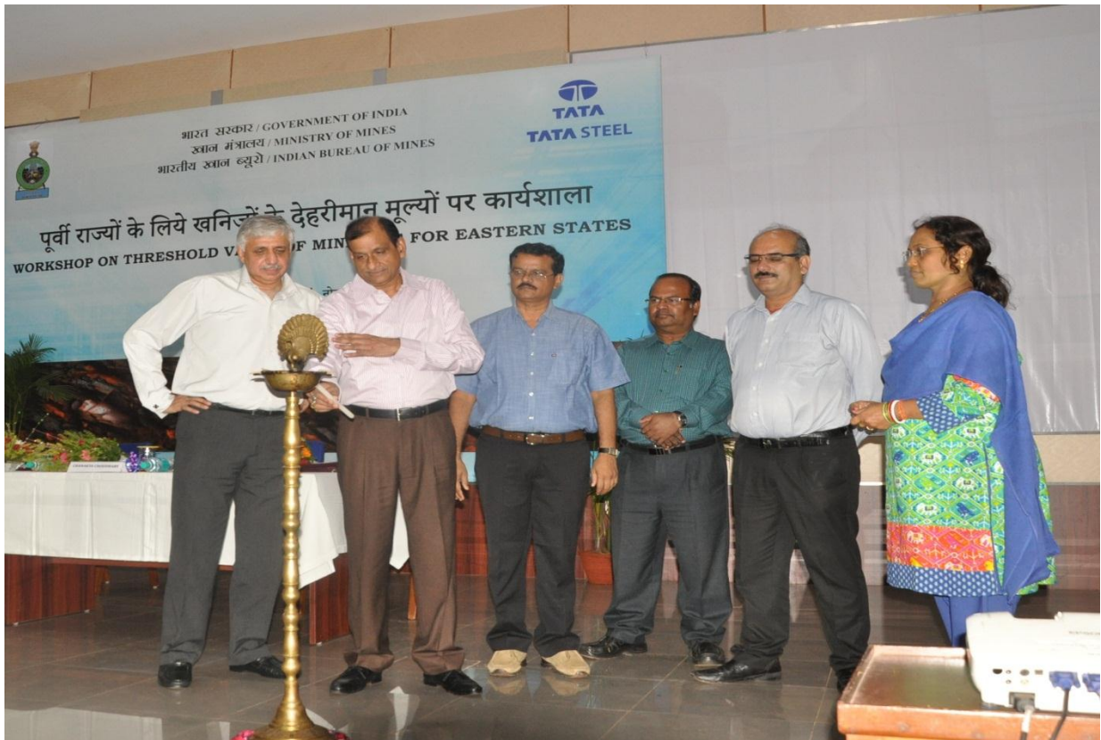
Lightening the lamp by the Guests