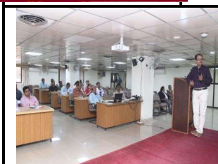
Lecture on MTS