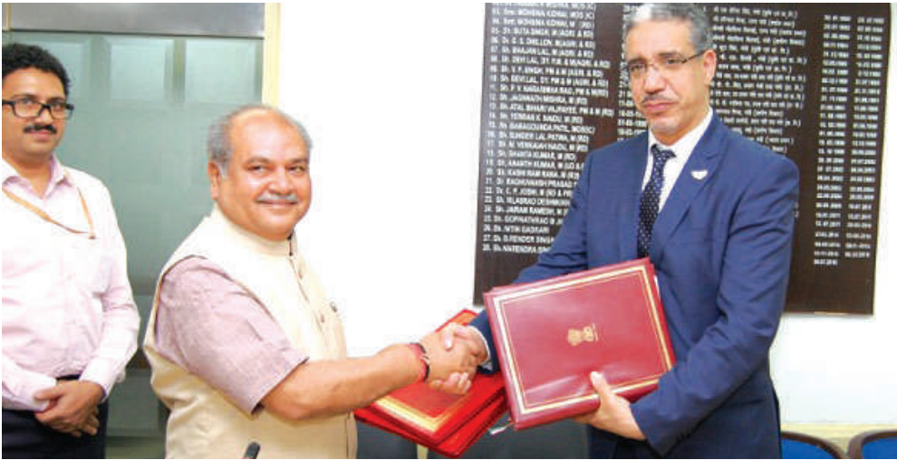
Shri Narendra Singh Tomar, Hon'ble Union Minister of Rural Development and Mines (left) and Mr Aziz Rabbah, Minister of Energy, Mines and Sustainable Development of Kingdom of Morocco exchange MoU at a programme in New Delhi.