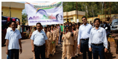
Students and NMDC officials taking out a Swachhta Awareness rally at Kirandul Complex of NMDC Ltd at an event conducted by IBM Regional office.

Indian Bureau of Mines observed the Swachhta Pakhwara during 16-31 October, 2018 at the Headquarters in Nagpur and at the Zonal/Regional as well as and Ore Dressing labs in Nagpur, Ajmer and Bengaluru.