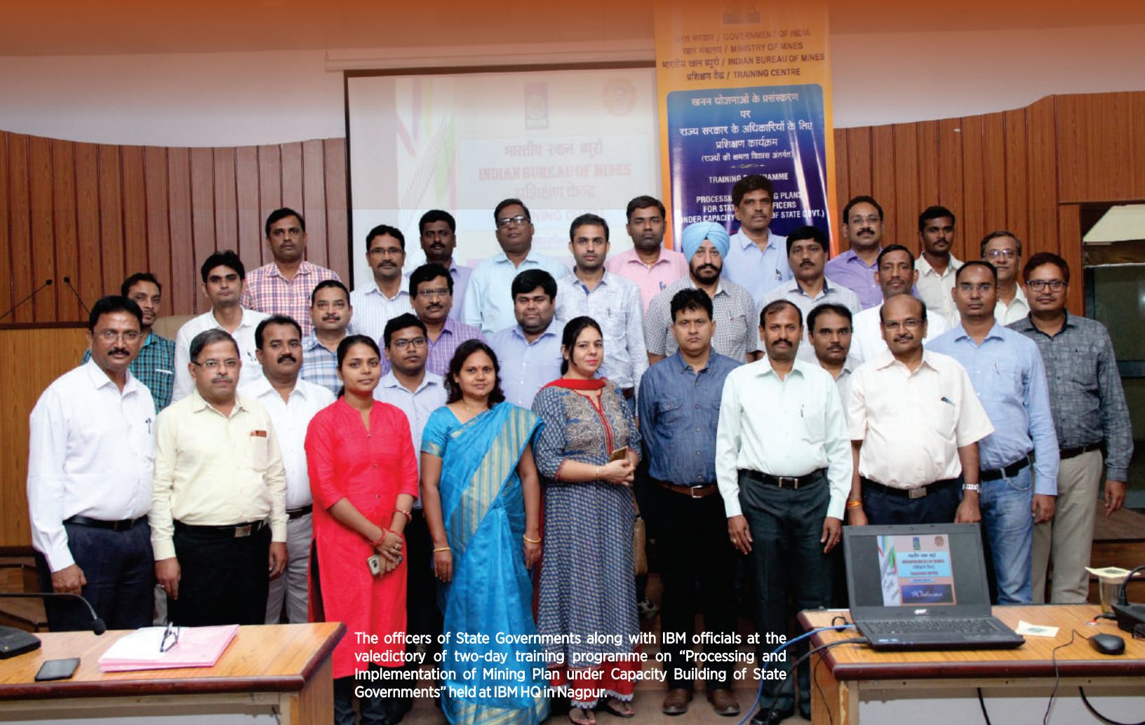
The officers of State Governments along with IBM officials at the valedictory of two-day training programme on "Processing and Implementation of Mining Plan under Capacity Building of State Governments" held at IBM HQ in Nagpur.