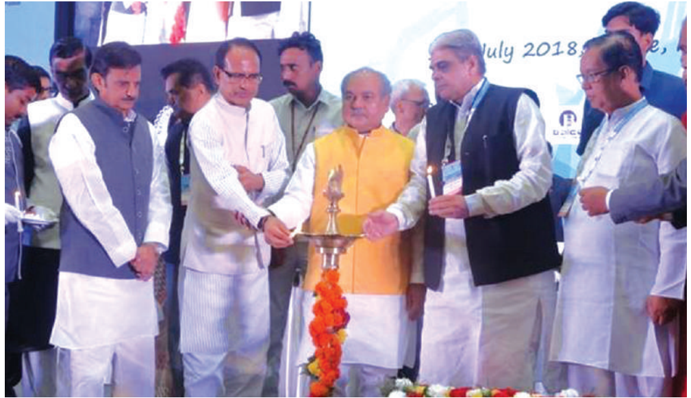
Shri Narendra Singh Tomar, Hon'ble Union Minister of Mines lighting the lamp to inaugurate the 4th National Conclave on Mines and Minerals held in Indore on 13 July, 2018. S/Shri Haribhai Parthibhai Choudhary, Hon'ble Union Minister of State for Mines, Shivaraj Singh Chouhan, then Chief Minister of Madhya Pradesh and others look on.

Shri Amitabh Kant, CEO of Niti Aayog said the mineral sector in India has a key role