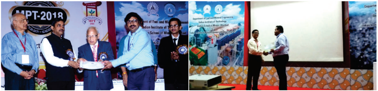
The officers of Mineral Processing Division, Indian Bureau of Mines receiving the best paper presentation awards – Khare Award and Peravadhanalu Award for best paper presentation on beneficiation and Characterisation, respectively at the 17th International Seminar on MPT-2018 held at the IIT-ISM campus in Dhanbad.