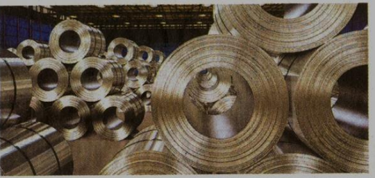
Slowdown in domestic construction activities and adverse weather conditions have taken a toll on the company

Production during May picked up slightly to 6.9 lakh