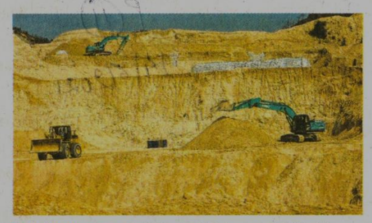
Fight for supremacy: In 2019, the U.S. imported 80% of its rare earth minerals from China, says U.S. Geological Survey.

"The expected exponential growth in demand for minerals that are linked to clean energy is putting more pressure on U.S. and Europe to take a closer look at where the vulnerabilities are and the concrete steps these governments can take," said