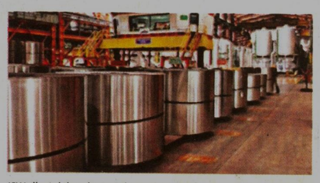
JSW alleged that the cartel cost the company hundreds of millions of dollars in lost profits and increased expenses

They repeatedly stated that they could make semi-finished steel slab in the quantities and quality to meet JSW